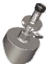
Quick release ring Dr. Bender