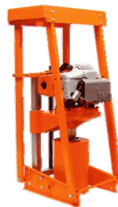
excavator conversion kit